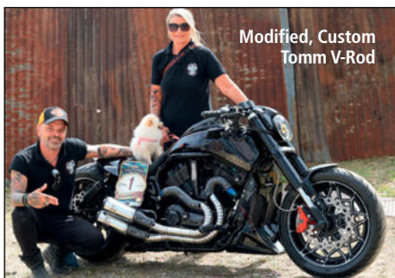
Modified, Custom Tomm V-Rod