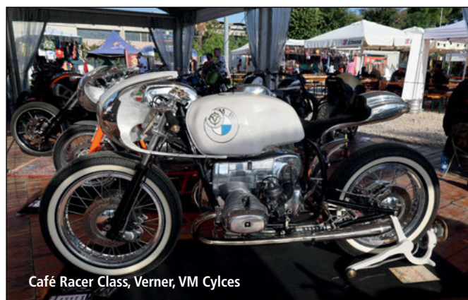
Café Racer Class, Verner, VM Cylces

holiday season in Europe (September 14-17) - would 'event fatigue' have set in and would 'life get in the way?'