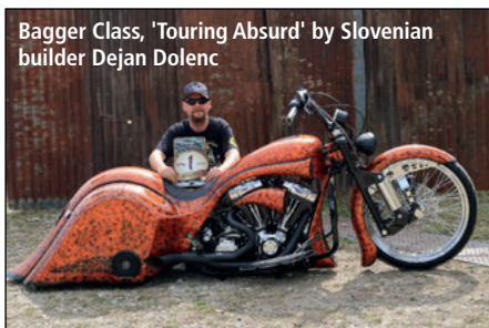
Bagger Class, 'Touring Absurd' by Slovenian builder Dejan Dolenc