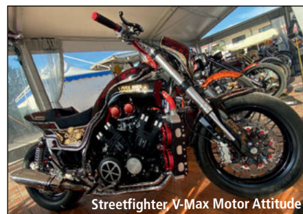
Streetfighter, V-Max Motor Attitude